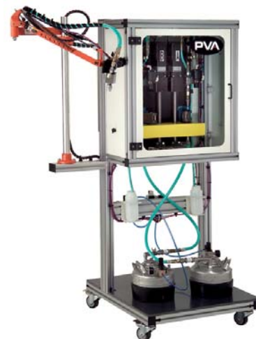
MX3000-VR shown with optional tool balance arm