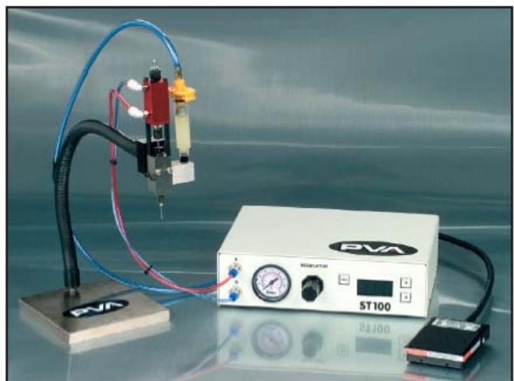
ST100 shown with optional stand and valve.

One Mustang Drive Cohoes NY 12047 tel 518 371 2684 fx 518 371 2688 www.pva.net